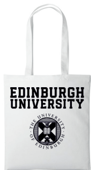
WHITE - AAETB1