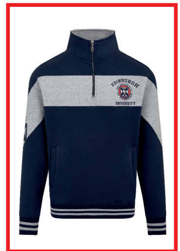
2 Panel Quarter Zip