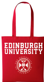
RED - AAETB1