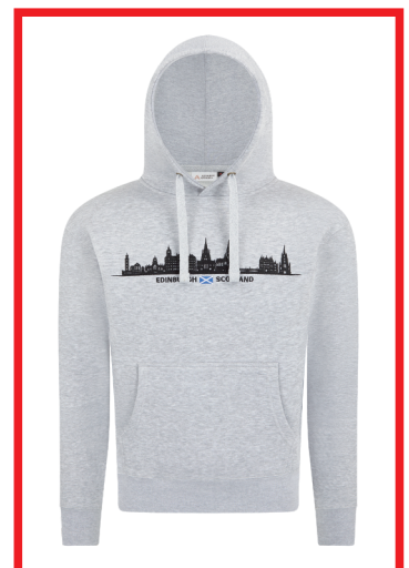
Edinburgh Landmark Hood