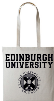
NEUTRAL - AAETB2

MINIMUM ORDER QUANTITY 12 PCS PER COLOUR PER STYLE