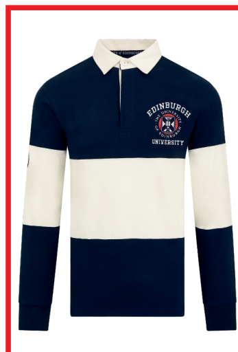
2 Panel Rugby Shirt