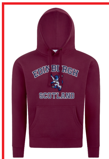
Edinburgh Scotland Hood