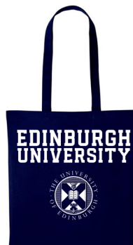
NAVY - AAETB1