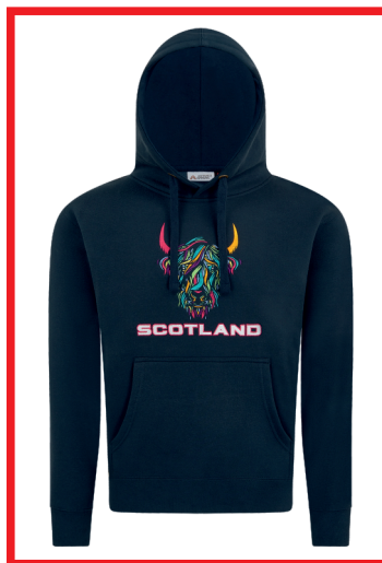
Highland Cow Hoodie