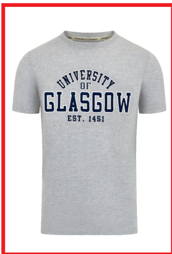
University of Glasgow Emb T-Shirt

Neck Labels, Neck Taping, Fabric Sticking, Screen Printing & Embroidery Applique, In-house Design Team